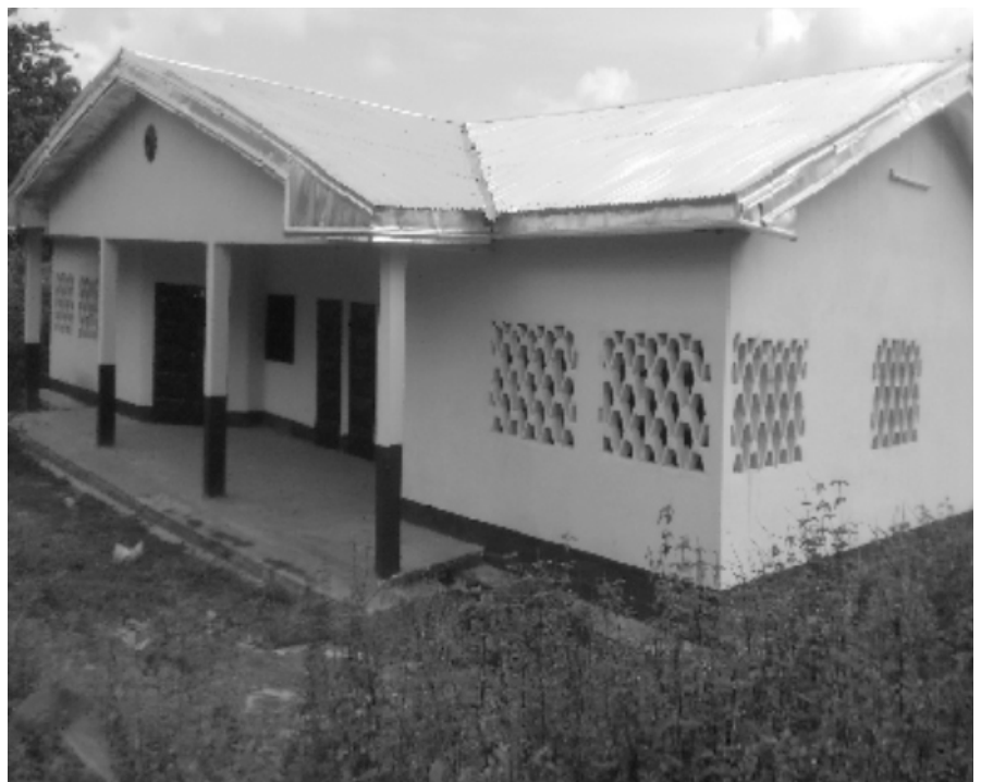
GS Chong kang

Nwa council at the centre of local development